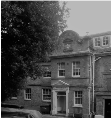
Front Elevation on Hillside Street

The Old Manor House in Hythe has had its fair share of illustrious residents, but none more exalted than George I, albeit his stay was very brief. George I, Elector of Hanover, had succeeded to the throne in 1714. He preferred Hanover and visited five times during his short reign, travelling with a huge entourage including his mistress. In June 1725, George set off for his fifth trip. He hunted, took the waters and did politics with the Prussians. He was supposed to leave in mid-October, but procrastinated until finally leaving on 22 nd December.