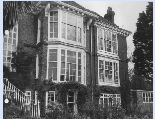
Back elevation of the Old Manor House not seen from the road

A Norman wall and Saxon remains have been discovered here.