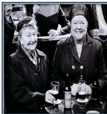
Photos of the Brewery, plus Coronation Street characters Ena Sharples and Minnie Caldwell enjoying a Milk Stout