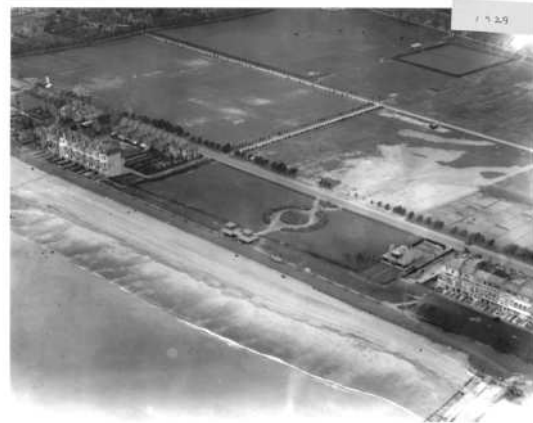
1929 Aerial photo

These magnificent shelters (centre of the photo) were built in an oriental style on Marine Parade in 1896. They were linked to South Road by a small circular ornamental garden.