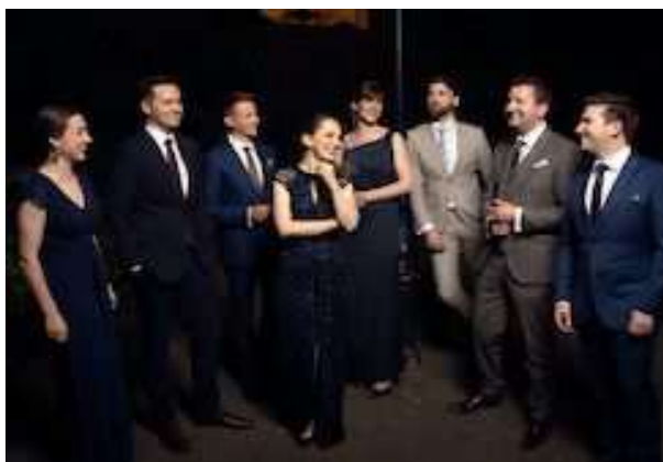
VOCES8 at Jam on the Marsh

101 High Street / Open Door Project: Renovation and fitting out of the property is nearing completion with the Open Door project soon to get under way. If you would like to become involved in any way as a volunteer, or are just interested to find out more, please email 101opendoorproject@gmail.com