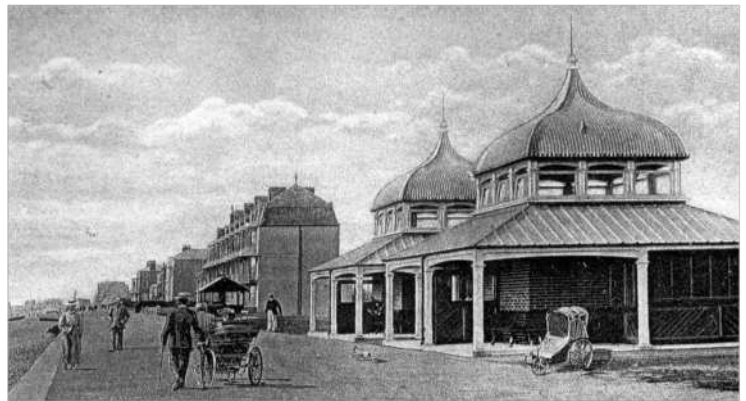
Early 1900's photo

These magnificent shelters (centre of the photo) were built in an oriental style on Marine Parade in 1896. They were linked to South Road by a small circular ornamental garden.